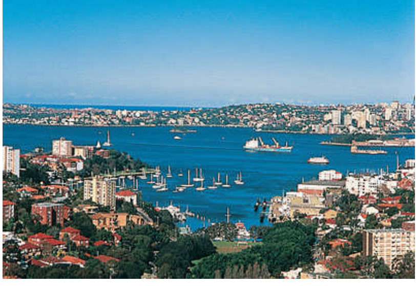
Rydges North Sydney has both harbour and park views.