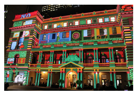
Website for VIVID Light Show: www.vivid.sydney.com/ Vivid, a festival of light music and ideas.

A typical view from the North Sydney Harbourview Hotel